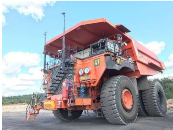
Dump truck for autonomous driving system

Besides, the integrated brushless DC motor is equipped with an actuator itself provided with a controller that can be available for sale separately as a single unit. The motor can also be used in a variety of applications by customizing the magnet and the motor length which adapts them to the software and the required torque.