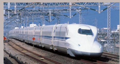
N700 Shinkansen that made its debut on July 1

Trains running at high-speeds such as the Shinkansen require various efforts other than the design to improve riding comfort. Our semi-active suspension system is one of them. The system improves the riding comfort by reducing vibrations and internal noise to realize a space for pleasant transportation.