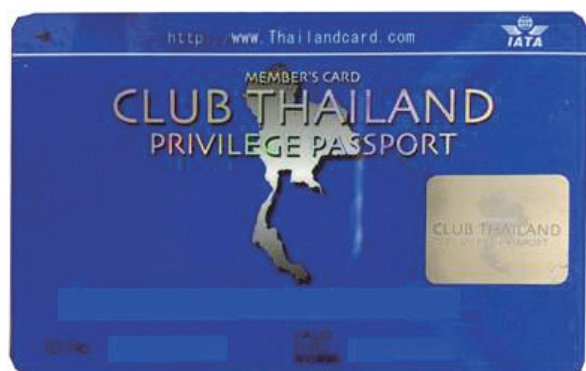
Photo 3 Club Thailand member's card

Tap water in Bangkok is unfit for drinking, unlike the water in Japan. To prepare for water shortages, our family used the water delivery services offered by Club Thailand. This company operates a water delivery business and has golfing reservation services as well. Users must pay an annual fee, but having a Club Thailand card (Photo 3) offers perks such as complementary drinks at Club Thailand stores (located near the first supermarket to cater to Japanese people, the Fuji Supermarket, allowing shoppers to drop by between shopping). The card also offers discounts at restaurants, and is a convenient card to have, even if you do not play golf.