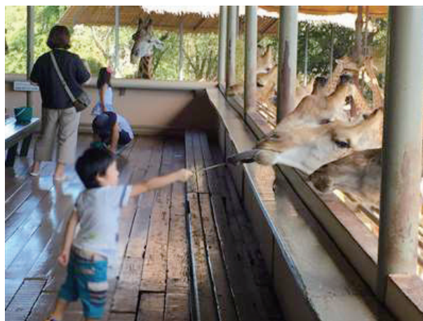
Photo 7 Giraffes at Bangkok's Safari World

Another place that children enjoy is the zoo. Our family often visited Bangkok's Safari World, where one can feed the herd of giraffes (Photo 7). Please note that toddlers may become frightened as so many giraffes come to feed.