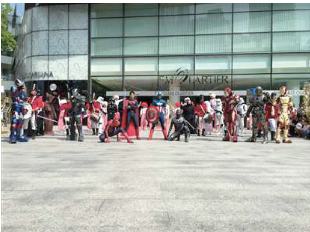
Photo 1 Children's Day event

It may be because of this culture that Children's Day in Thailand is a major event. I remember when the department store EmQuartier brought in famous overseas heroes to entertain children (Photo 1). It was almost as though we were in Hollywood!