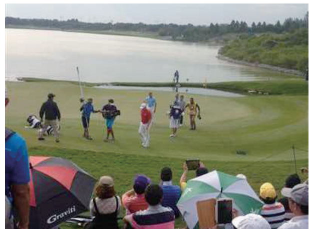
Photo 6 Professional golf tournament at the Amata Spring Country Club

If you have never tried golf before in Japan, Thailand is an excellent place to start learning. The warm climate loosens up your body, and the courses are more level and easier to swing in than Japan. There are many people who enjoy golf every weekend, due to this wonderful environment.