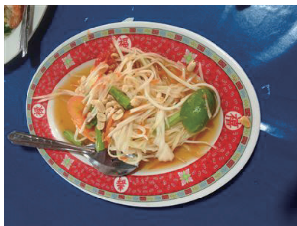
Photo 4 Som Tum Thai

My favorite dish was Pad Thai (Thai fried noodles) with oysters, or Som Tum Thai (salad with green papayas) (Photo 4). I miss these dishes, even now!