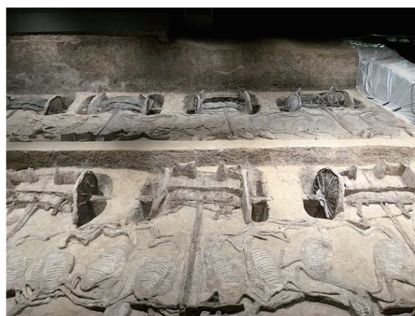
Photo 2 Remains of the king of Chu