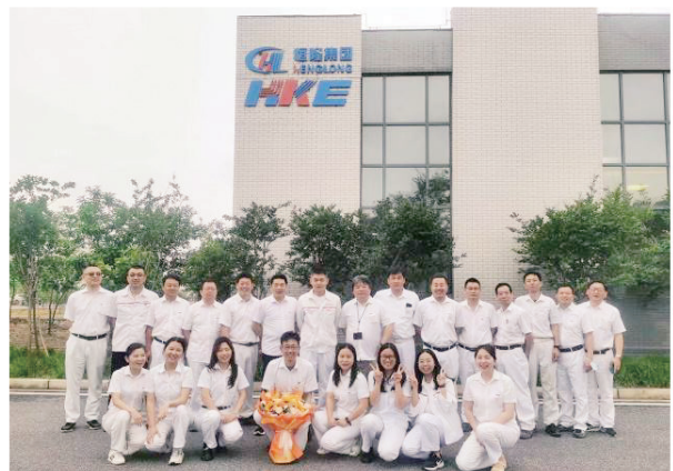
Photo 19 Commemorative photo of repatriation