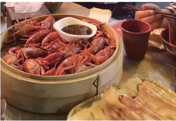
Photo 12 Steamed crayfish dish

Due to COVID-19, I was required to take a PCR test every day in China. Foreigners had difficulty traveling in the country for a while because they had to prove negative with another PCR test application on their smartphone every time they entered a new city. Actually, it was not easy to move around due to movement restrictions, even though I was an expatriate in China away from home. Therefore I bought a bicycle. I joined a local cycling team and rode 100 km or more in a day with the team members (Photo 13). I also enjoyed several other unexpected hobbies, including camping (Photo 14).