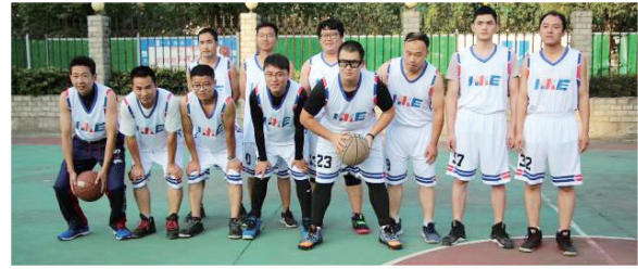
Photo 6 Basketball competition