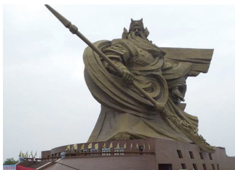
Photo 1 57.3 m high statue of Guan Yu

Jingzhou City is home to only a dozen or so foreigners, despite its population of over six million. In urban cities like Shanghai, many people do not know the name of Jingzhou, even if they are Chinese. People who live in a "rural" town are not familiar with foreigners. If you go to a restaurant, you will be welcomed as a rare customer. Of course, there are Japanese restaurants in town, but they serve Japanese food adapted to the local people. I almost never encountered Japanese cuisine as I expected.