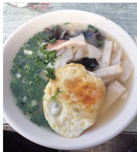
Photo 10 Dalian Noodle