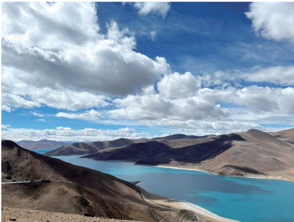
Photo 17 Fantastic sky and lake