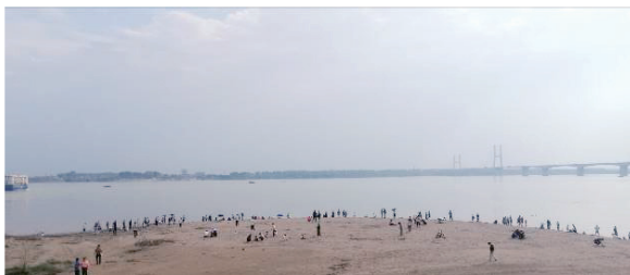
Photo 3 Sand beach of Yangtze River

Jingzhou City holds a marathon competition every year as a big event of the city. More than 20,000 runners take part in the competition, supported by many local people ringing Chinese gongs along the marathon route and students cheering. I was fortunate enough to participate in a half marathon race twice, in 2019 and 2023 (Photo 4).