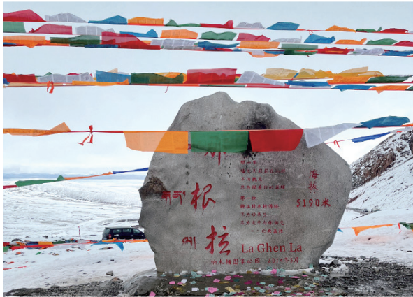
Photo 15 At an altitude of 5190 m near the Himalayas