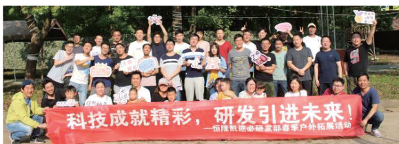
Photo 5 Recreational activity

In September of the following year, 2019, the company moved to a new factory. The move itself was a big activity with a concerted effort by the expatriates and local employees (Photo 7).