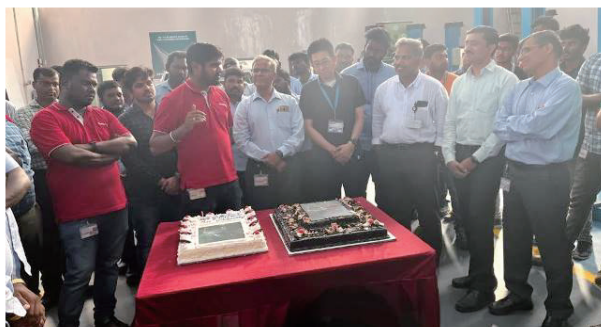
Photo 8 1st production vehicle celebration event

After the start of mass production for the order, the dual pinion EPS product also enjoyed more orders from Chinese automobile manufacturers (OEMs). Their total annual production together with column EPS exceeded one million vehicles. On the other hand, Chinese manufacturers developed products very quickly. In some cases, we had to prepare mass production for a new order in a year or even half a year.