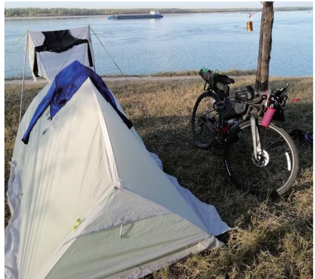
Photo 14 Camping on the Yangtze River beach

I was able to do some limited travel despite the restrictions of COVID-19. I had one trip to see the Terracotta Army that was placed around the tomb of Shi Huangdi of the Qin dynasty. This was the last sightseeing trip during that period.