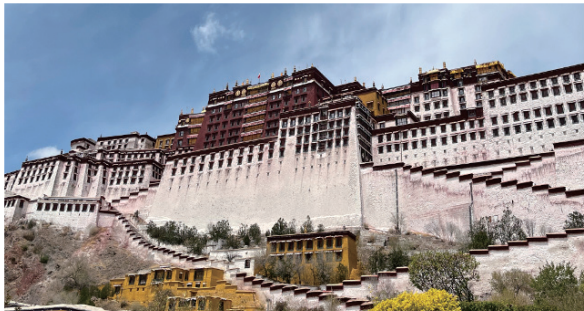
Photo 16 Potala Palace