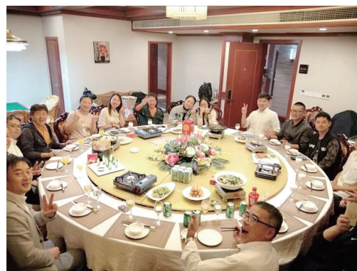
Photo 9 Circular table

Remember that alcoholic beverages are often served at room temperature. It is important to find restaurants that sell cold beer or ask for it the next time.