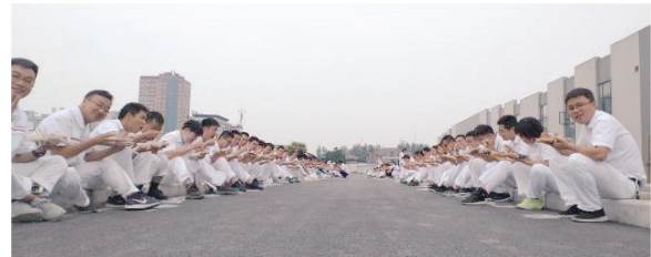
Photo 7 Lunch during the move of the new company

By the end of January 2020, COVID-19 was widespread. Since Jingzhou is close to Wuhan City, I returned home to Japan two days before the lockdown began because I was informed that traffic would be blocked. At first, I thought it would be easy to return to China soon after the effects of COVID-19 had subsided in a few weeks. However, the effects spread all over world, and I had no immediate prospect of returning to China. All the nine expatriates at that time could not return to China together. They had to return in four different groups. I was in the first group to return. We took a chartered flight from Kansai International Airport and arrived in Wuhan in July 2020. I was isolated in a hotel in Wuhan for two weeks after our arrival, and at home in Jingzhou City for another two weeks, for a total of 28 days of isolation. During my stay in Wuhan, a nearby Japanese supermarket, AEON, supplied me with Japanese food. I was surprised that I could eat Japanese food, which was much more delicious than the Japanese restaurants in Jingzhou City.